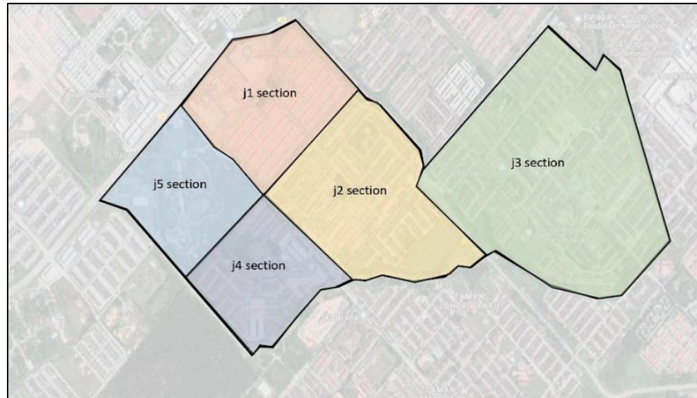
Figure 3: Case study area