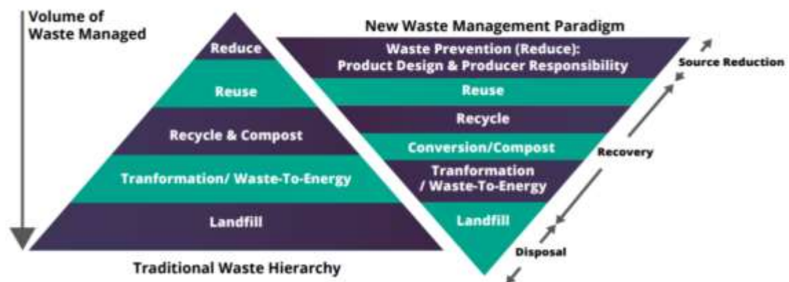
Figure 1: Diagram on Modern Methodology on Waste and Landfill Management

The Malaysian government has established a new waste management paradigm, as depicted in Figure 1, to address the increased volume of waste generation sustainably. As reported in the Green Technology Master Plan (GTMP) 2017-2030, through this paradigm, the collected waste is transferred to a station that serves as an intermediate step to make the waste collection system more efficient and cost-effective. Furthermore, current landfills will be equipped with innovative systems, new regional sanitary landfills and decommissioning low-performing ones will be developed, and unsafe landfills will be upgraded. This strategy, unfortunately, is unsustainable in the long run since landfilling increases greenhouse gas emissions and directly contributes to global warming.