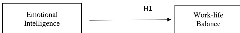
Figure 2: Relationship between emotional intelligence and work-life balance

Emotional intelligence is one of the factors believed to influence work-life balance. It refers to the capability of perceiving emotions, assessing and producing emotions, comprehending emotions and emotional knowledge, and controlling emotions so that emotional and intellectual growth can be fostered (Mayer & Sakovey, 1997). Based on a study by Muthu et al (2015), emotional intelligence, job engagement, and organisational support had positive and significant relationships with work-life balance. Hence, a noteworthy remark is that emotional intelligence may significantly influence how work-life balance can be maintained. Employees with emotional intelligence might be capable of monitoring and handling their emotions. Besides, emotional intelligence enhances the performance of both individuals and organisations because it has a big impact on the types of jobs that employees perform and their relationships with the organisations (Rangreji, 2010). Hence, how employees feel and express their emotions has an impact on their performance, thereby enabling the employees to solve problems either at work or family-related.