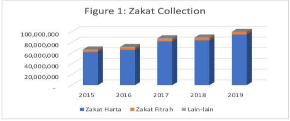
Figure 1 depicts the total collection of zakat Melaka between year 2015 to 2019. The chart shows that the zakat on wealth are the highest contribution of zakat collection in the range of 92 to 95 percent, followed by the zakat fitrah and others categories of zakat. According to Zakat Melaka, others zakat includes zakat on wealth that has been accrued from the payers and adjustments of zakat wealth from prior year. The trend for zakat collection in