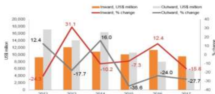
Figure 2: Foreign direct investment of Malaysia, 2012 – 2017

The graph is fluctuating and moving downwards from 2012 to 2017 as shown in the Figure 2 below. OFDI percentage change is negative from 2013 to 2017 for Malaysia. From 2015 to 2017, OFDI became moderate with average an average of around 34 billion annually that is 2.7% of GDP between 2015 and 2017. Therefore, research urged for more cautious measures on countries OFDI (BNM, 2018).