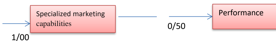
Figure 2. Conceptual framework of study

The data collected was analyzed using LISREL which is a multivariate modeling technique. LISREL aims to explain the structure or pattern among a set of latent (unobserved or theoretical) variables, each measured by one or more manifest (observed or empirical) and typically fallible indicators .The LISREL model assumes a causal structure among a set of latent variables. These latent variables appear as underlying causes of the observed variables