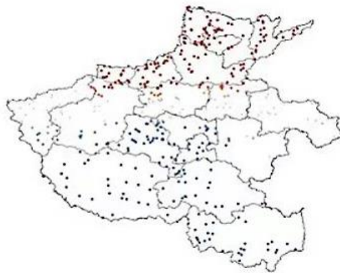
Figure 1. High/Low Clustering and Hot Spot Analysis of rural tourism in Henan.

Combined with Getis-Ord G i * hot spot analysis, all provinces show a different level of cluster. And the Long Hai railway line from San Menxia to Shang Qiu can be the boundary of clusters. In these regions, there is no significant cluster presented. According to the result, the high clusters are more focused in the north part of the province, mostly distributed in the north of the Yellow River, and present characteristics near the Tai Hang mountains and along the Yellow River. Opposite the northern places, in the south of the province, low clusters tend to be distributed along the local main rivers, such as the Huai River, few distributed near the mountains (Figure 1).