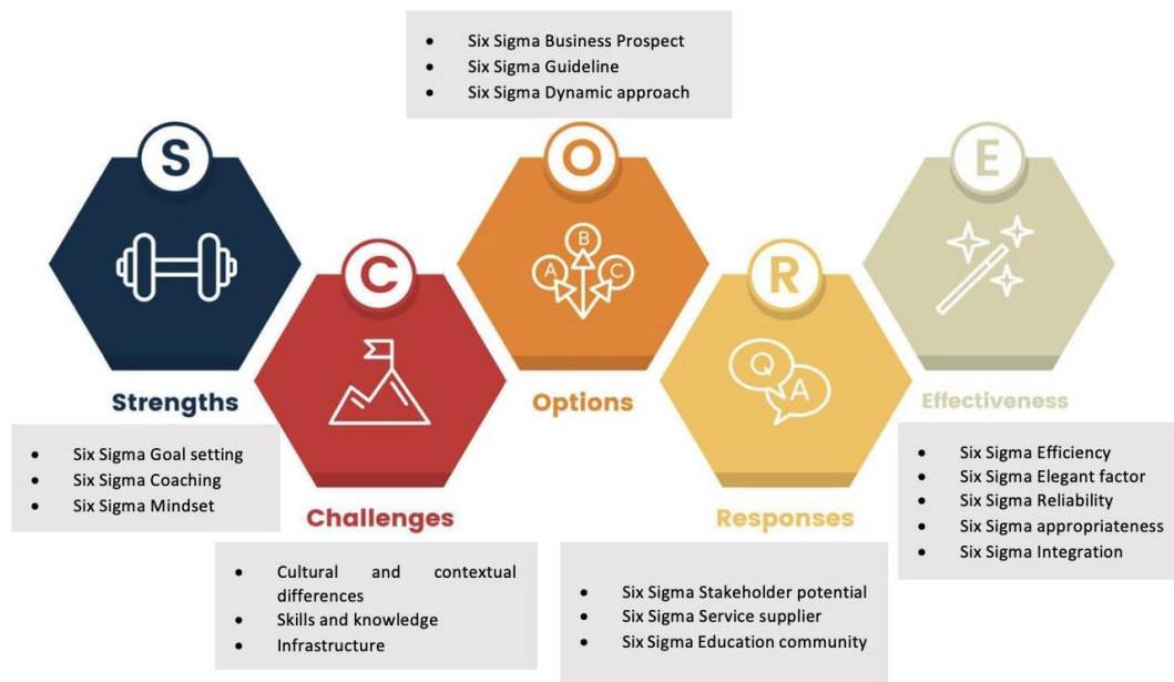
Figure 2: SCORE Framework Model on Six Sigma

The SCORE Six Sigma Framework Model, illustrated in Figure 2, offers a comprehensive view of the strengths and weaknesses of the Six Sigma approach and suggests integrated actions to enhance its implementation. This model is a valuable tool for monitoring the ongoing progress of Six Sigma, particularly in education.