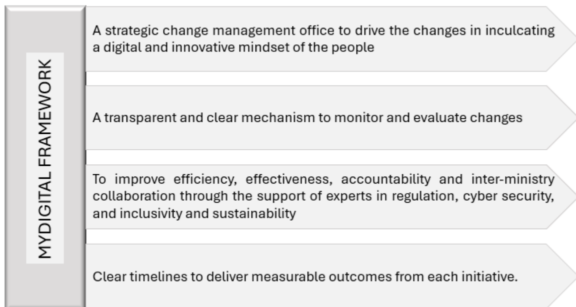
Figure 3: MyDIGITAL Framework

Malaysian government has introduced several frameworks and initiatives to foster the development and integration of emerging technologies into the economy. Figure 3 shows the MyDIGITAL framework aiming to transform the nation into a leading digital economy, making full use of technologies like AI, IoT, and blockchain (Azhar et al., 2021). The goal is to drive economic growth, improve public services, and foster digital inclusivity. In addition, the National Artificial Intelligence Framework was launched to accelerate AI adoption across industries such as healthcare, finance, agriculture, and manufacturing (Geetha et al., 2024). Further, with the 5G Rollout Malaysia has undertaken the deployment of 5G networks, a crucial step to increase connectivity and enable innovations in smart cities, IoT applications, and industrial automation (Geetha et al., 2024). Another example is the establishment of the Digital Free Trade Zone (DFTZ): to promote e-commerce and digital trade by leveraging emerging technologies like blockchain for supply chain optimization and payments (Chin et al., 2023).