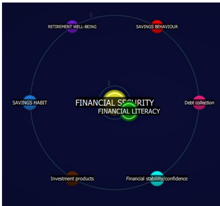
Figure 2: Thematic Analysis

To interpret the findings in this study, the researchers outlined first-hand records comprising the background, detail and report to elucidate the information (Taylor & Bogdan, 1998; Basit, 2003). The objective of analyzing the information derived from the interview session conducted for this study was to structure the data-gathering process (McCracken, 1988) and to collate the interview narrative into themes or patterns during data analysis by clustering, comparing and contrasting the processes (Miles & Huberman, 1994). Notes were taken on the interview sheet during the interview sessions, and participants were allocated sequential numbers starting from number 1 to 25 to conceal identities. Quirkos software, offering a highly visual and user-friendly interface for data management and analysis, was used to import all transcripts. To explicitly address the study's question, a deductive theme analysis was conducted, with the transcripts being organized and coded using the Quirkos program.