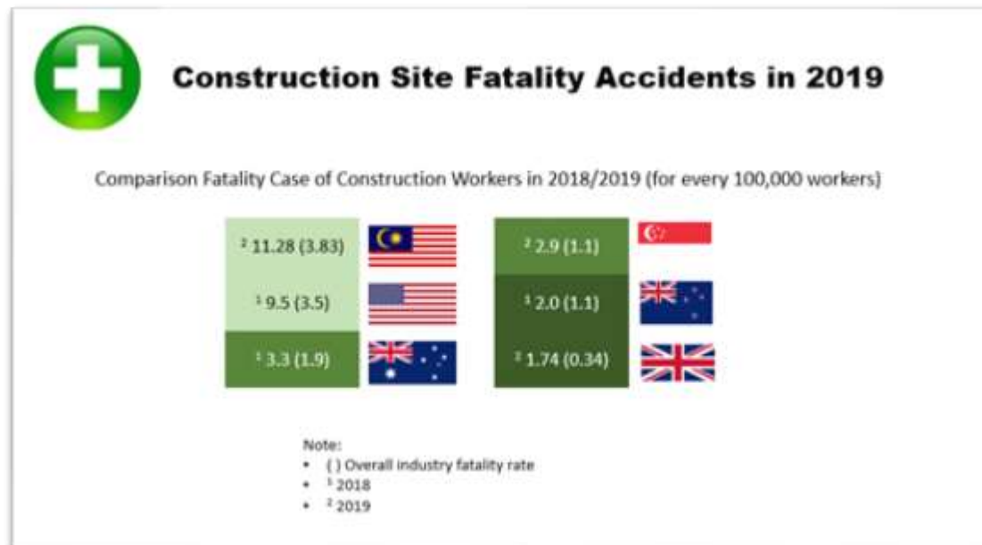
Figure 1. - Comparison Fatality Case between Malaysia and 5 Develop Countries

that requires efficient OSH management in order to reduce a significant number of fatalities in construction sites.